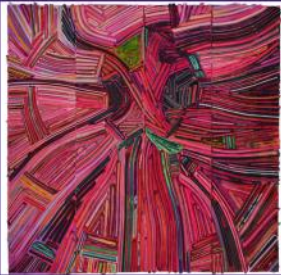
"Tri-Colour Red" by Kit Vincent