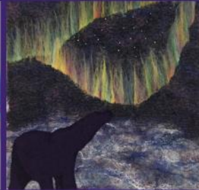
"Oh What a Night!" by Rosalind Sims